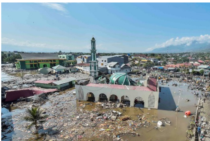
Baiturrahman Mosque, next door to Palu Grand Mall

How can it be? Surely there were prior tsunamis that hit this spot. How could people be so dumb as to put their town center and mosque right at the end of a tsunami scoop?